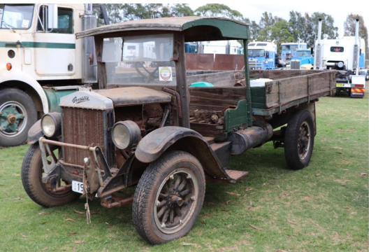
another fantastic success.